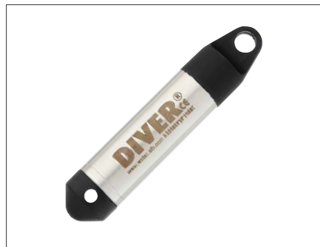
Diver dataloggers for accurate groundwater monitoring