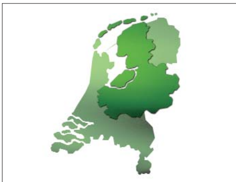
Vitens monitoring network

Since the data collected clearly showed decreasing drawdown levels, Vitens was able to identify when a pump's filter was drawing in air opposed to water and allocate resources to regenerate it as required, saving them time and money.