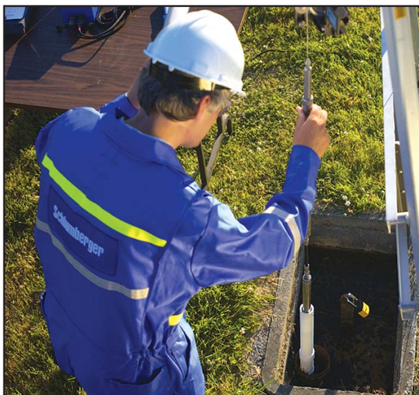
Accessing the multilevel Westbay System with portable wireline equipment.