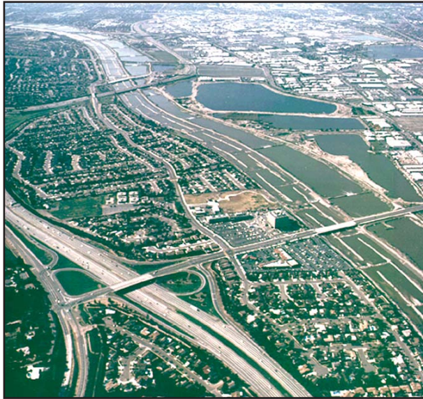
Orange County Water District facilities along the channel of the Santa Ana River