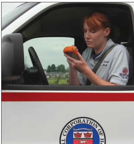
Data was wirelessly collected from a distance of 150 meters

Additional intrinsic costs incurred by the City before the adoption of Diver-NETZ included the hiring of qualified personnel, extensive personnel training, and expenses related to vehicle maintenance and operation.