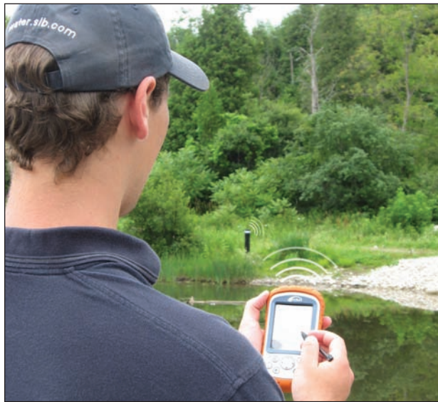
The Diver-NETZ wireless network decreased data collection efforts from 160 to 16 h/mth