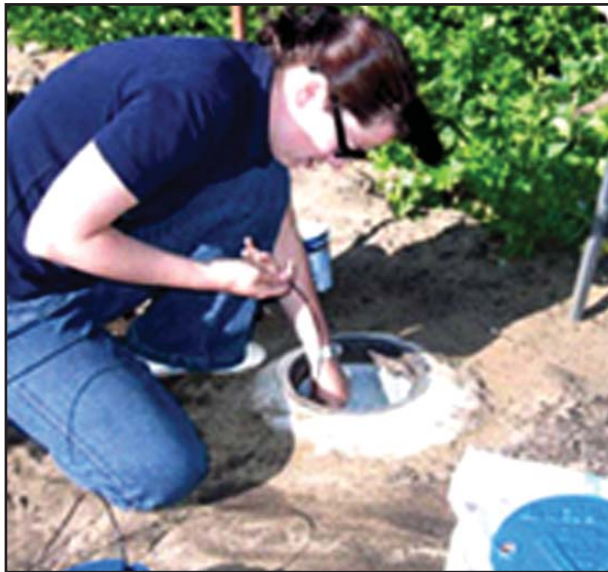
Suspending Divers into wells for continuous monitoring.