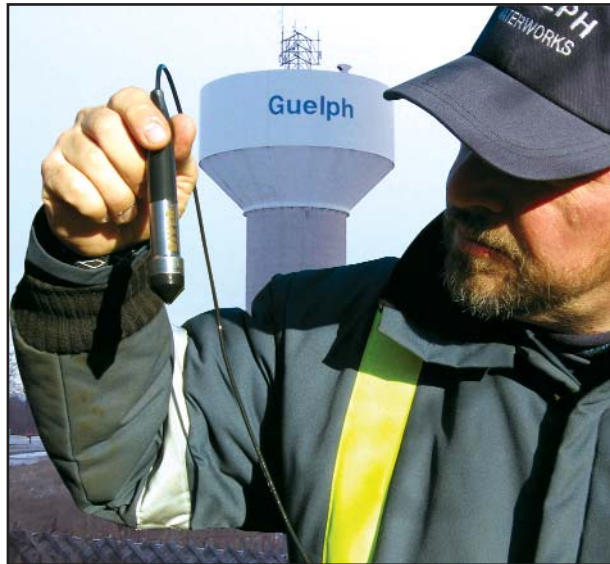
Groundwater monitoring using Diver dataloggers in the City of Guelph, Ontario, Canada