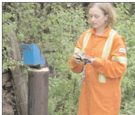
Programming Diver Dataloggers for continuous monitoring using hand-held PC