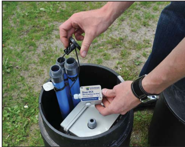
Diver-DCX is shown deployed inside a nested monitoring well casing